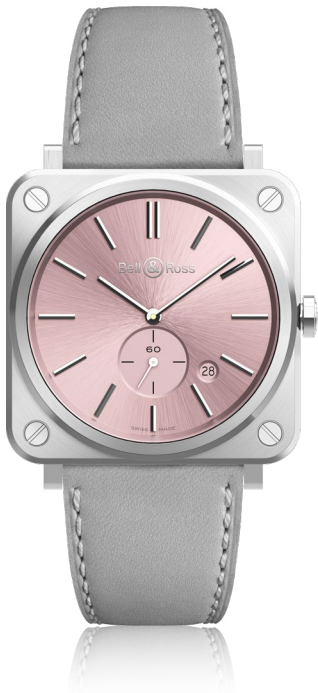
BR S NOVAROSA BRS-PK-ST/SCA