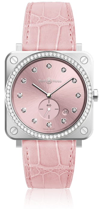
BR S NOVAROSA FULL DIAMONDS BRS-PK-ST-LGD/SCR