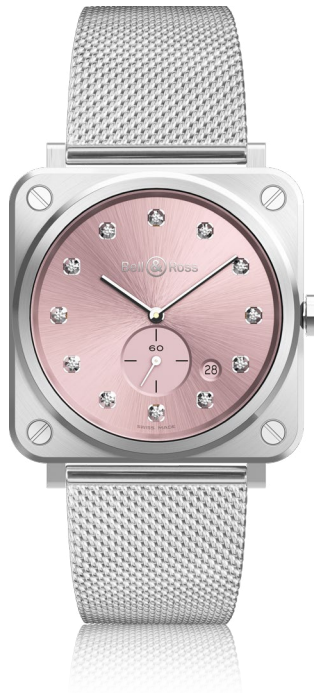
BR S NOVAROSA DIAMONDS BRS-PK-ST-DIA/SST