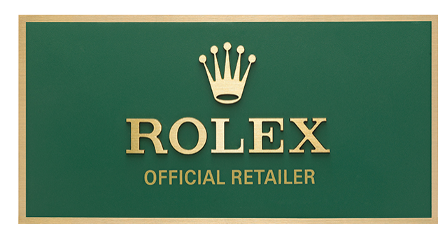
Find your retailer on rolex.com

Only official Rolex retailers, distinguishable by this official green plaque, are allowed to sell and maintain a Rolex. With the necessary skills, technical know-how and special equipment, they guarantee the authenticity of each and every part of your Rolex, not to mention its reliability over time, helping you make the choice that will last a lifetime.